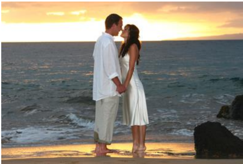
Mokapu Beach (North Wailea/South Kihei)