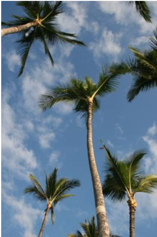
Po'olenalena (Makena Surf) Beach (South Wailea/North Makena)