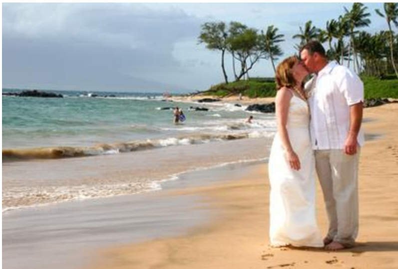
Tiki Beach (North Kihei)